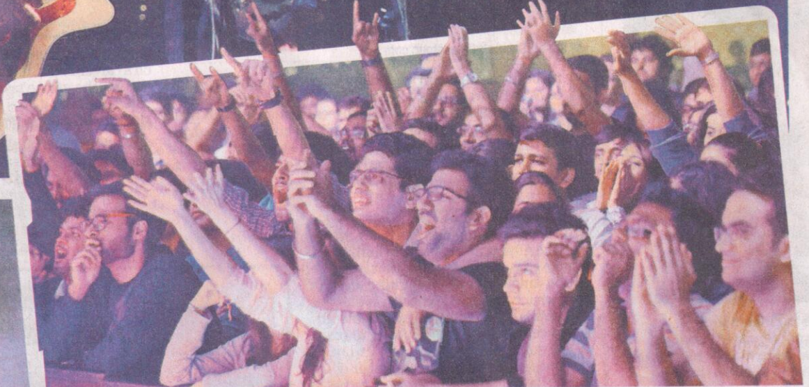
Students went into a frenzy when the band started performing